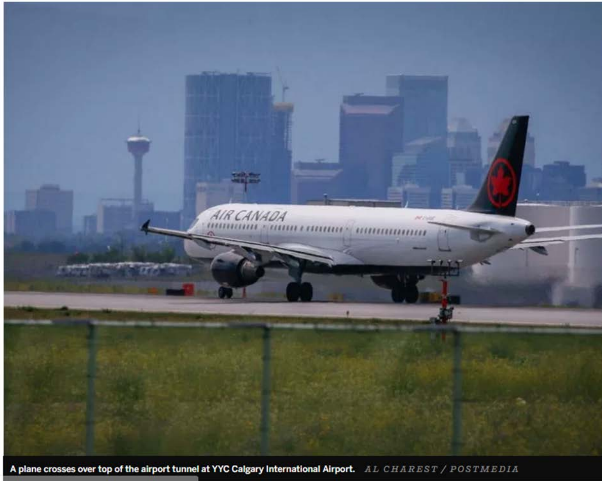
A plane crosses over top of the airport tunnel at YYC Calgary International Airport.

https://calgaryherald.com/news/local-news/flying-high-airport-reminds-travellers-not-to-bring-cannabis-across-border