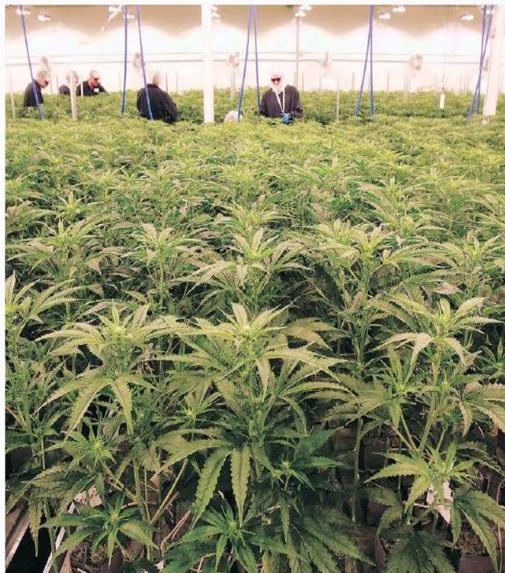
Recreational cannabis comes in two main strains, either Indica or Sativa.

Products including dried bud will be sold in pre-packaged form in one-gram and 3.5-gram quantities. Pre-rolled: Cannabis will also be avail-