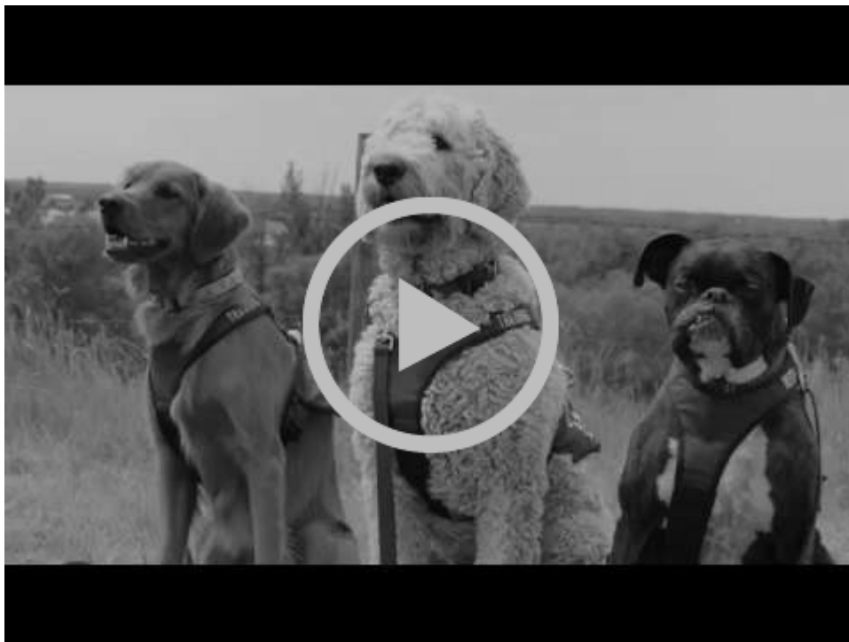
Video: A PAWSitive Support Project for Veterans with PTSD and Who Problematically Use Substances