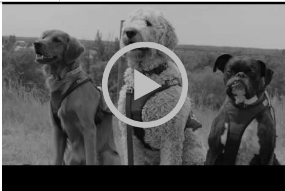
Video: A PAWSitive Support Project for Veterans with PTSD and Who Problematically Use Substances